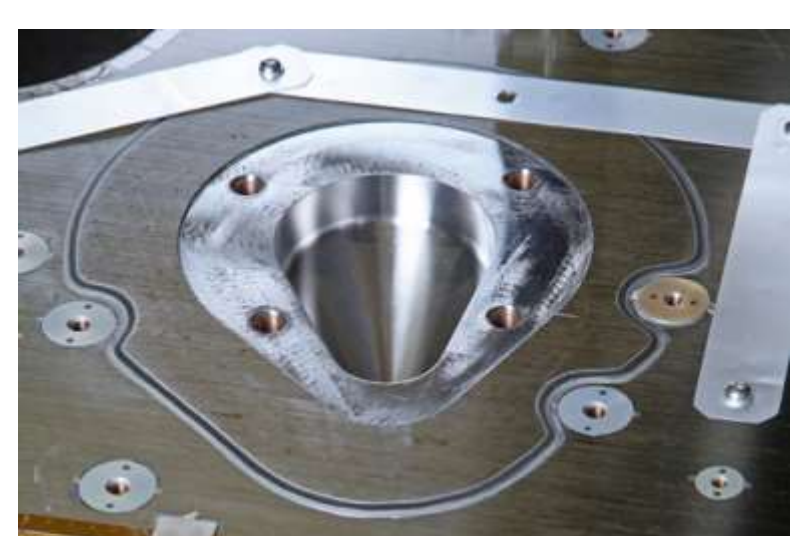
Sentinel - 2 MSI Structure - External structural doubler