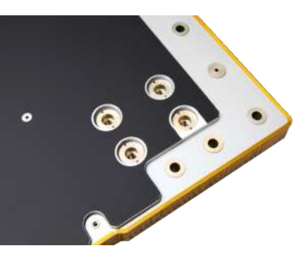
Sentinel - 5 P Panel External thermal doubler